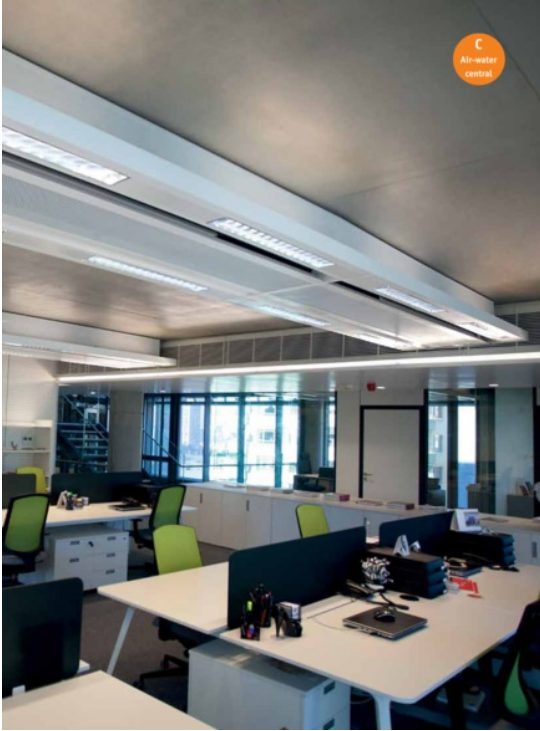
TMB Headquarters, Istanbul, Turkey

In rooms where high thermal loads prevail, air-water systems are the energyefficient alternative to all-air systems. Since they heat or cool the room air with air-to-water heat exchangers, the heating and cooling capacity can be provided independent of the required fresh air flow rate. Air-water systems may be installed 'openly', e.g. not concealed by suspended ceilings; a good example is the SMART BEAM, which was designed by Hadi Teherani. The most common installation, however, is in suspended ceilings.