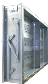
TUNNEL DAMPER WITH LINKAGE AND OPPOSED ACTION BLADES