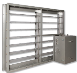
TUNNEL DAMPER TYPE JF-S