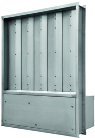
DAMPER FOR WALL INSTALLATION, WITH INTEGRAL ENCASED ACTUATOR