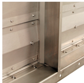
TUNNEL DAMPER WITH CENTRE MULLION (FROM B &GT; 1000 MM)