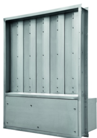
DAMPER FOR WALL INSTALLATION, WITH INTEGRAL ENCASED ACTUATOR