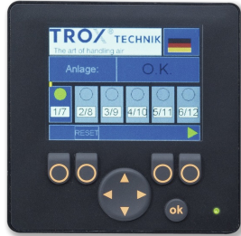
TNC-EC-AZM DISPLAY MODULE