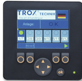
TNC-EC-AZM DISPLAY MODULE