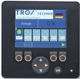
TNC-EC-AZM DISPLAY MODULE