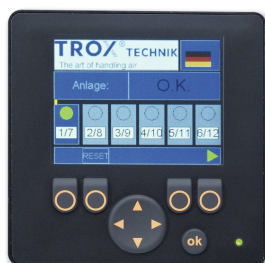
TNC-EC-AZM DISPLAY MODULE