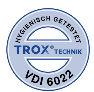
TESTED TO VDI 6022