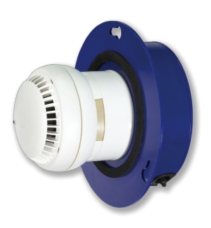
DUCT SMOKE DETECTOR RM-O-3-D