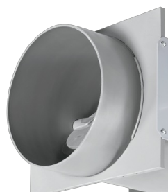
VARIANT WITH CIRCULAR SPIGOT