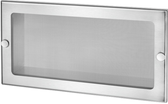
Front grille frame with wire mesh