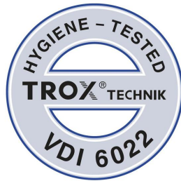
TESTED TO VDI 6022