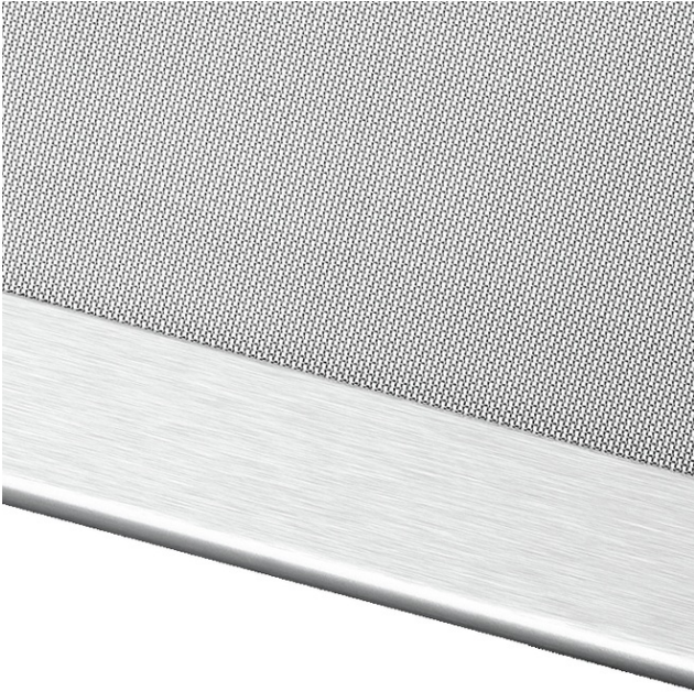
Knurled screw for tool-free fastening