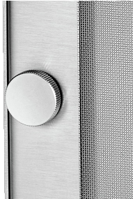
KNURLED SCREW FOR TOOL-FREE FASTENING