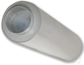
CIRCULAR SILENCER TYPE CAK