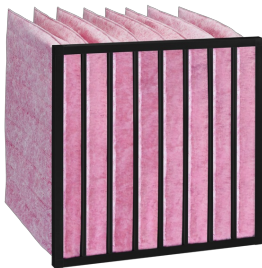
POCKET FILTER, TYPE PFG