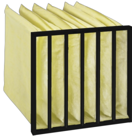
POCKET FILTER, TYPE PFS