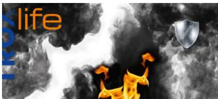
NO 23: FIRE + SMOKE RE PROTECTION AND SMOKE EXTRACT SYSTEMS.