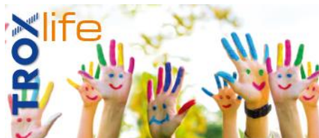
NO 22: SCHOOL + VENTILATION INTELLIGENT VENTILATION TECHNOLOGY NEEDS TO CATCH