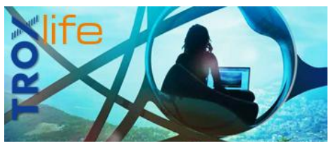
NO 18: COUNTRY AIR, CITY AIR. URBANISATION AND THE CONSEQUENCES.