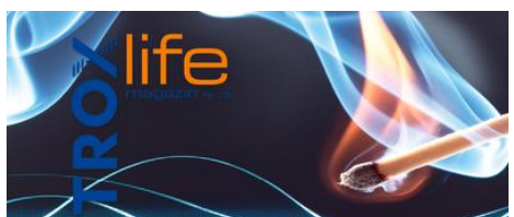
NO 15: SOUND AND SMOKE.