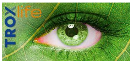
NO 19: SUSTAINABILITY. SUSTAINABILITY IS THE FUTURE.