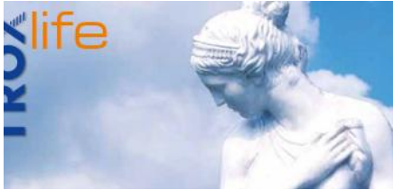
USEUM AIR. HE ART OF HANDLING ART.