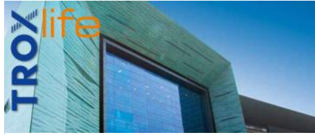
EXHIBITION AIR. ARCHITECTURE NEEDS TO BREATHE.