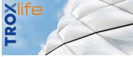
STADIUM AIR. STADIUMS AND THEIR PARTICUL. FLAIR