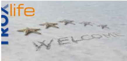
OTEL AIR. HE WORLD A GUEST AT TROX.