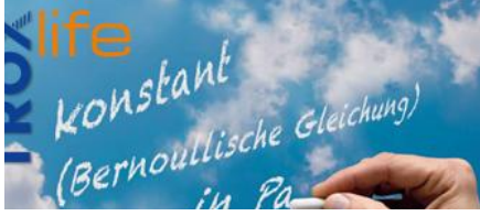
EDUCATION AIR. OR HIGH MARKS IN THE LASSROOM.