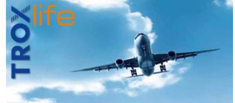
AIRPORT AIR. THE ART OF HANDLING AIRPORT: