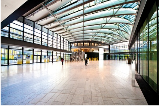
ADAC, Munich, Germany

Large and high reception areas require air terminal devices that can throw the air far into the room. Intelligent control systems ensure that the airflow is quickly adapted to uses of varying intensity and to varying climate conditions.