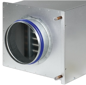
Heat exchanger with copper tubes and aluminium fins