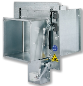
KA-EU WITH ELECTRIC BLADE OPENING ACTUATOR