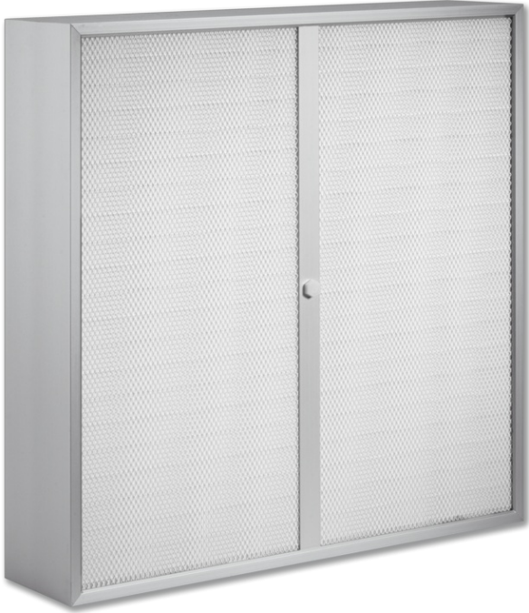
FHD - Construction with centre mullion