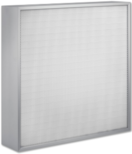
FHD &#x2013; CONSTRUCTION WITHOUT CENTRE MULLION