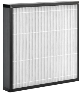
Z-LINE FILTER, CONSTRUCTION PLA