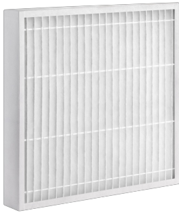
Z-LINE FILTER, CONSTRUCTION NWO