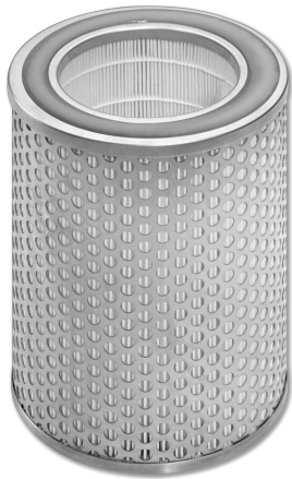
MINI PLEAT FILTER CARTRIDGE, TYPE MFCA