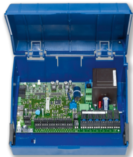
EASYLAB ADAPTER MODULE TAM