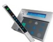
Beleuchtungsschaltung über Bedieneinheit