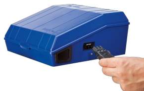
CONNECTION SOCKET FOR LIGHTING