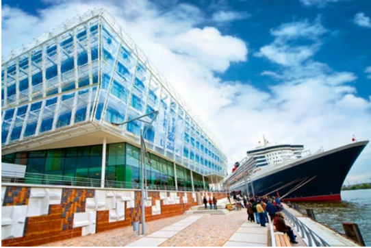
Unilever, Hamburg, Germany

Central and decentralised air-water systems have the following advantages: