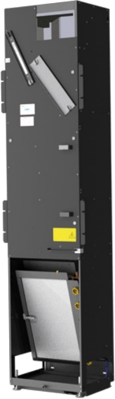
Vertical supply air and extract air unit FSL-V-ZAB with heat exchanger and heat recovery bis 42 l/s bis 150 m 3 /h B: 396 mm H: 1.800 mm T: 319 mm