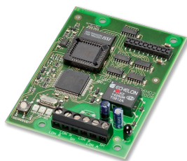
CENTRAL BMS INTERFACE