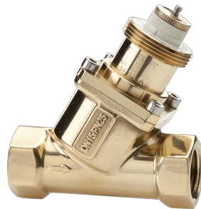
PRESSURE INDEPENDENT CONTROL VALVE