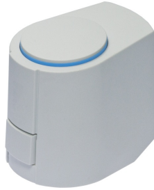
VALVE ACTUATOR FSL- CONTROL II