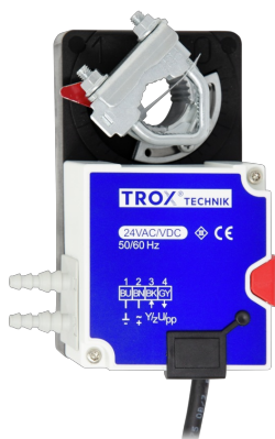
XB0 for TVR, TVJ, TVT, TZ-Silenzio, TA-Silenzio, TVZ, TVA, TVM