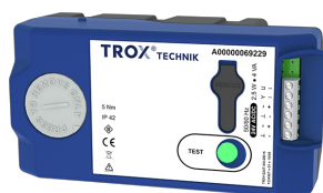
XB0 for TVE