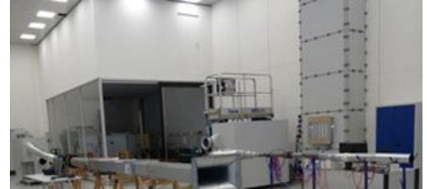
TEST FACILITIES CONTROL TECHNOLOGY