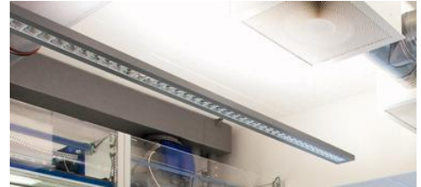
LABORATORY TECHNOLOGY DEMO ROOM