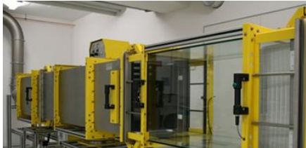
FOR HIGHEST DEMANDS FILTER TECHNOLOGY