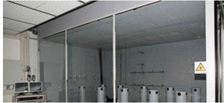
TEST FACILITIES AIR DISTRIBUTION TECHNOLOGY