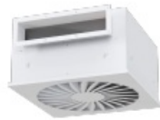
Side entry, rectangular spigot