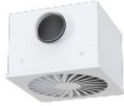
Side entry, circular spigot