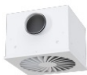
Side entry, circular spigot