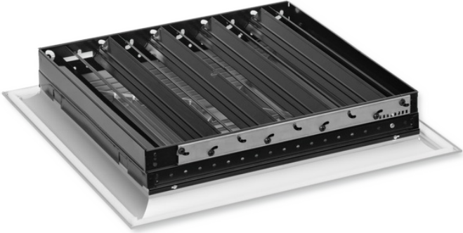
WITH DAMPER BLADE