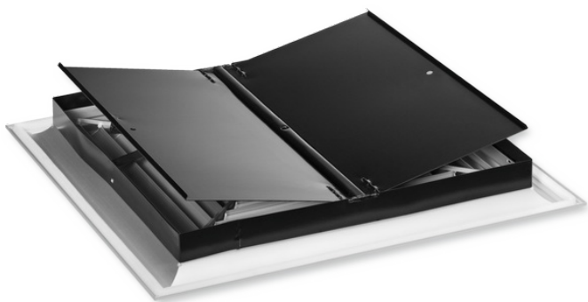
WITH BUTTERFLY DAMPER