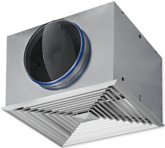
WITH PLENUM BOX