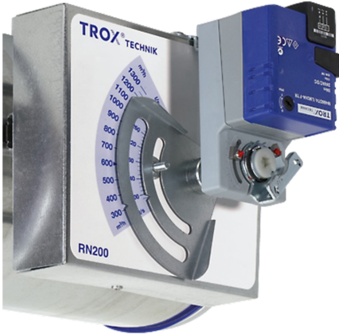
ACTUATOR FOR SWITCHING BETWEEN SETPOINT VALUES