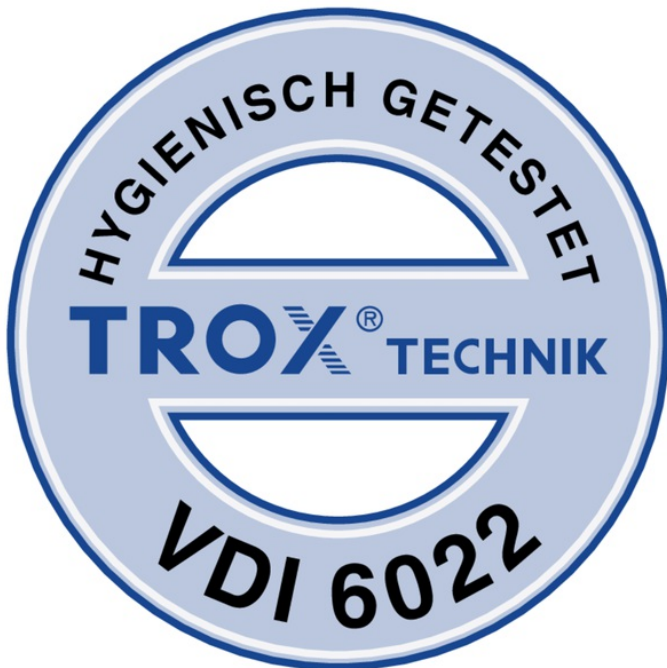
TESTED TO VDI 6022