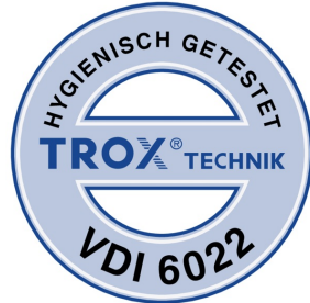
TESTED TO VDI 6022