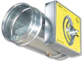
CAV CONTROLLERS TYPE RN-EX