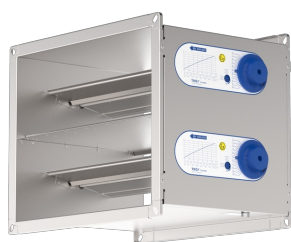
Unit with two controllers