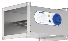
CAV CONTROLLERS TYPE EN-EX