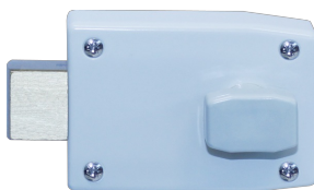
CYLINDER RIM LOCK