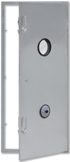
LOW-LEAKAGE STEEL DOOR, VARIANT ST-R/Z15

Steel door with inspection window, pressure relief valve and cylinder rim lock (Profile cylinder on the opening side, cylinder rim lock on the closing side)