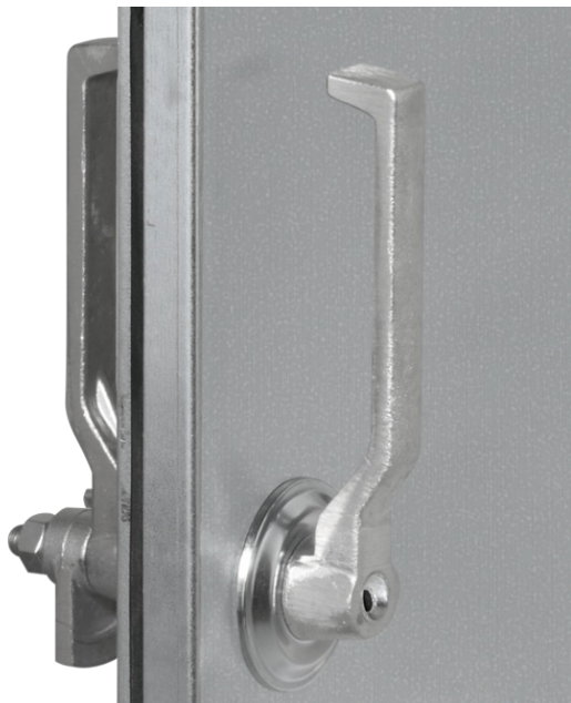
Cylinder rim lock (interior lever)