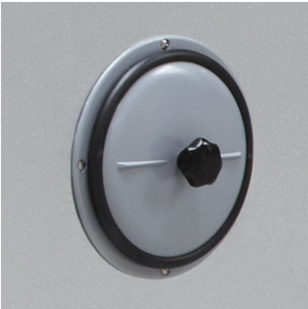
Removable front locking lever (of double lever locking device)