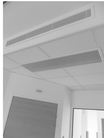
Air-water systems by TROX offer high comfort levels due to low airflow velocity in the occupied zone.