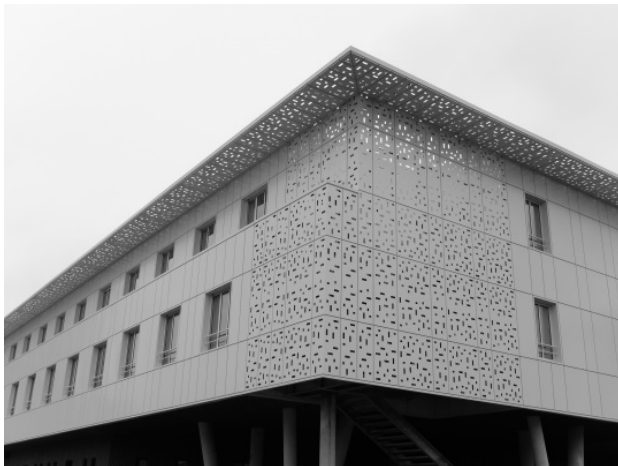
Exterior view of the new nursing home building in the southwest of France.

The TROX DID-E chilled beam diffusion solution in the bedrooms and the DID632 in the communal areas feature a high level of induction, thereby fulfilling the global energy consumption criteria of the site. The DID-E beams are equipped with a complete extract air system at the factory (plenum, removable grill) which means that they meet the planning requirements of the site. Nothing has been left to chance: the VFL regulators, which function when more than 30 pa of pressure is present, make it possible to reduce the operating pressure of the handling units for consistently improved savings on the operating costs.