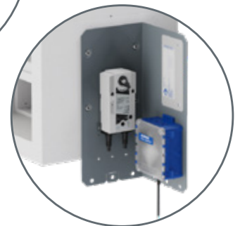
Version AA with exposed drive for immediate actuation