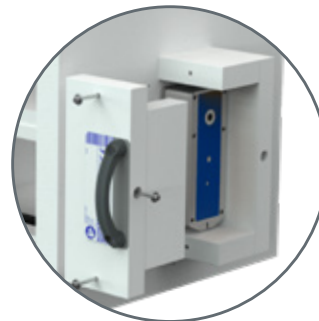
MA version with thermally encapsulated drive (standard test: triggering in the 25th minute)