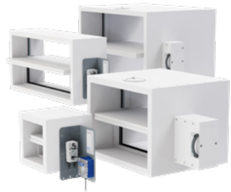
The EK2-EU is available in different designs

The EK2-EU is certified with all control modules. A complete system from a single source.