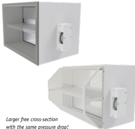
Larger free cross-section with the same pressure drop!